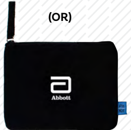
b Canvas zippered bag