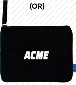
b Canvas zippered bag