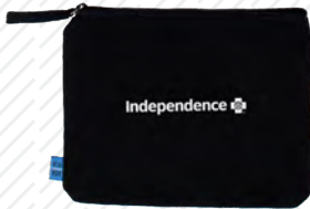
b Canvas zippered bag

Life can get busy and stressful. Our LIVE MINDFULLY CARDS help you slow down, focus and recharge. It's a go-to resource to calm the mind, find work-life balance, get better sleep, and gain inner happiness. This 3.5" x 2" card set makes it convenient to keep at your desk, in your bag, or on the go.