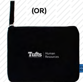
b Canvas zippered bag