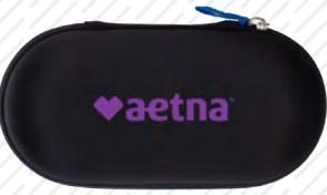
a Semi hard zippered case