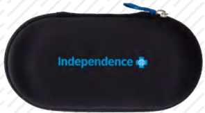
a Semi hard zippered case