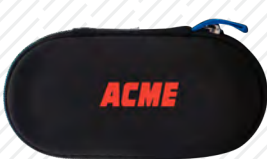
a Semi hard zippered case