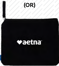
b Canvas zippered bag

Our most affordable wellness kit in the FitKit collection, the FITKIT MINI packs a big punch and includes a resistance band and BeActive exercise cards to encourage activity, inspire and help create healthy habits.