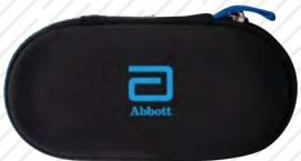
a Semi hard zippered case